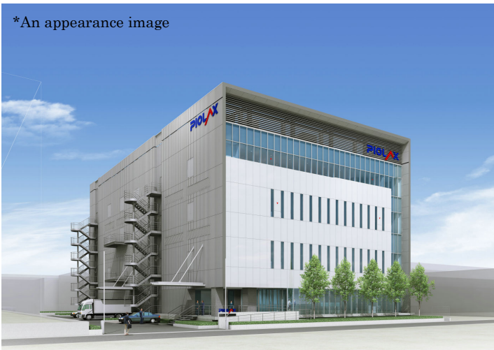
*An appearance image